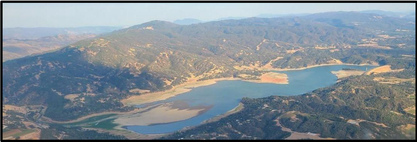
Photo Credit: Russian River Confluence Fall 2021 Cover Photo credit: Erin Watt, Russian River April 2022